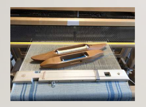
Month 6: Compound Weaves, with Supplementary Sets: Unit Weaves